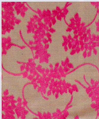
"Spring Velvet" thibautdesign.com